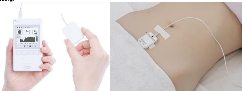
Figure 1. Liliium \alpha -200, a new portable ultrasound bladder scanner (left), and its small US probe placed on the suprapubic region (right)

The present results suggest that continuous measurement of bladder volume by Liliium \alpha -200 is feasible within normal range of bladder capacity and may be applied to monitoring urine volume in the bladder for determining appropriate timing of prompted voiding.