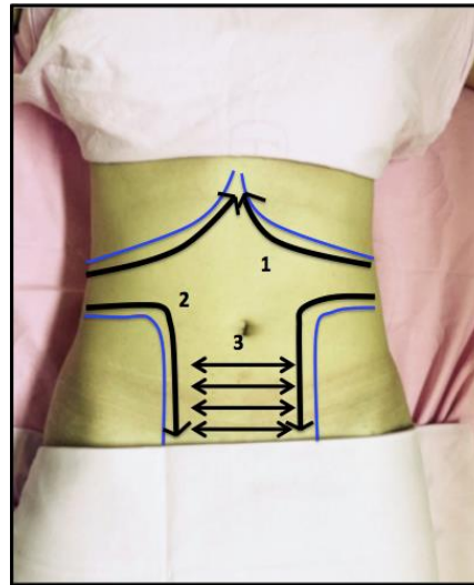
Figure 2. Directions of connective tissue manipulations on anterior pelvic region